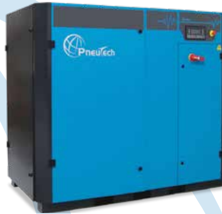
Ri Fixed & Variable Speed Rotary Screw 60HP-220HP