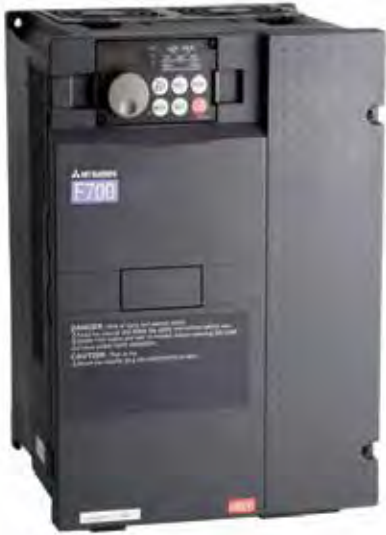
Variable Frequency Inverter Unit