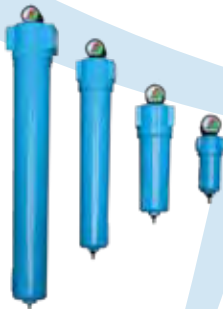
FHO Inline Filtration