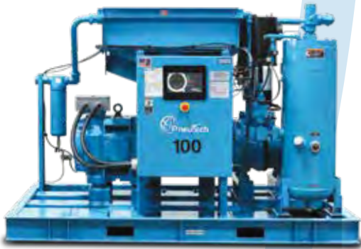
RSP Fixed Speed Rotary Screw 75HP-450HP