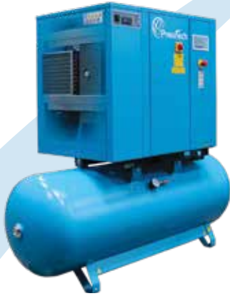
RK Fixed Speed Rotary Screw 5HP-50HP