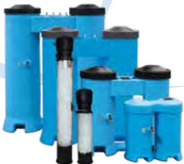
CSO Oil Water Separators