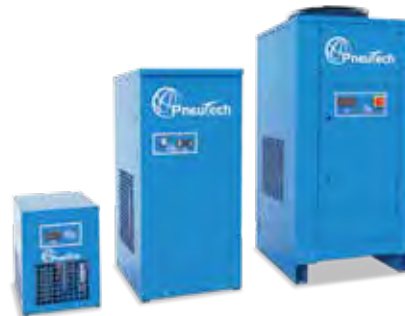
RDA Refrigerated Air Dryers