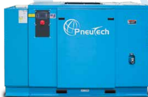
RSP Variable Speed Rotary Screw 75HP-450HP