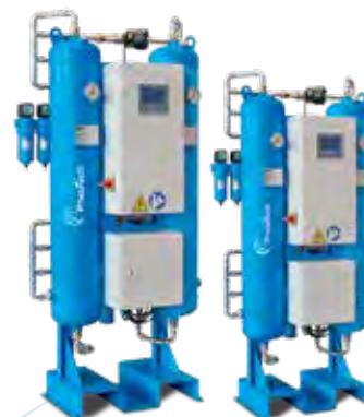
NGO Nitrogen Generators